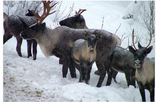
The last known caribou in the South Selkirks has been relocated to Revelstoke, along with two others from the Purcell herd.

There was lots of discussion about the project and the future of the caribou from the Selkirk and Purcell. Lots of interest. The news article/video worked as a terrific engagement tool.